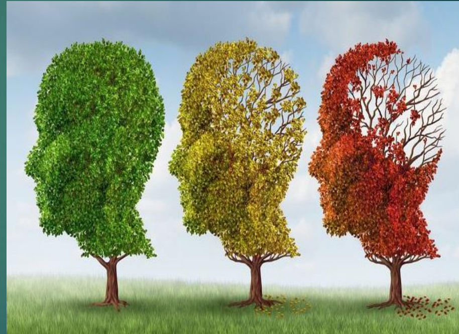
Will & Preference (wishes)