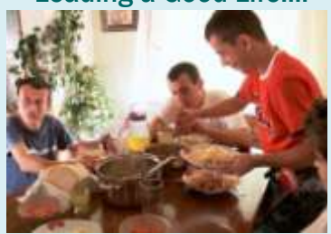
.... ordinary lives in ordinary places